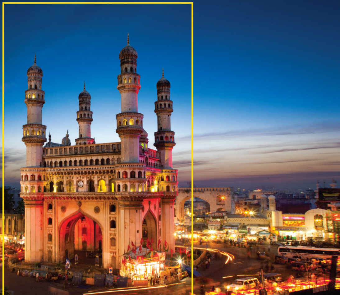
Hyderabad's Historical Icon: Charminar